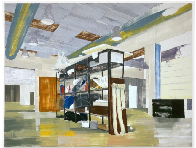
Institute of Porous Media, 2007 Wolfgang Hambrecht 200 x 270 cm, Oil/Acrylics on canvas

Anthea Art Investments AG Bundesplatz 16 CH-6304, Zug Switzerland Tel.: +41 41 720 0990 Email: info@anthea-art.com